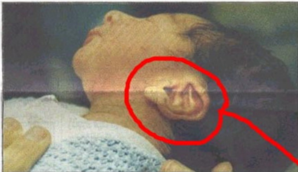
The arabic word "ALLAH" written on a baby's ear (magnified view)